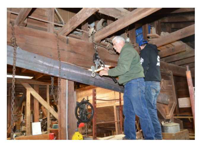
At this point the steel plate is almost in place. It is held against the wood beam by wood clips. Note the safety chains that prevent it from falling.